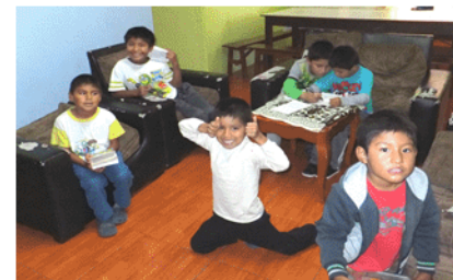
Children from New Hope Centre, Arequipa